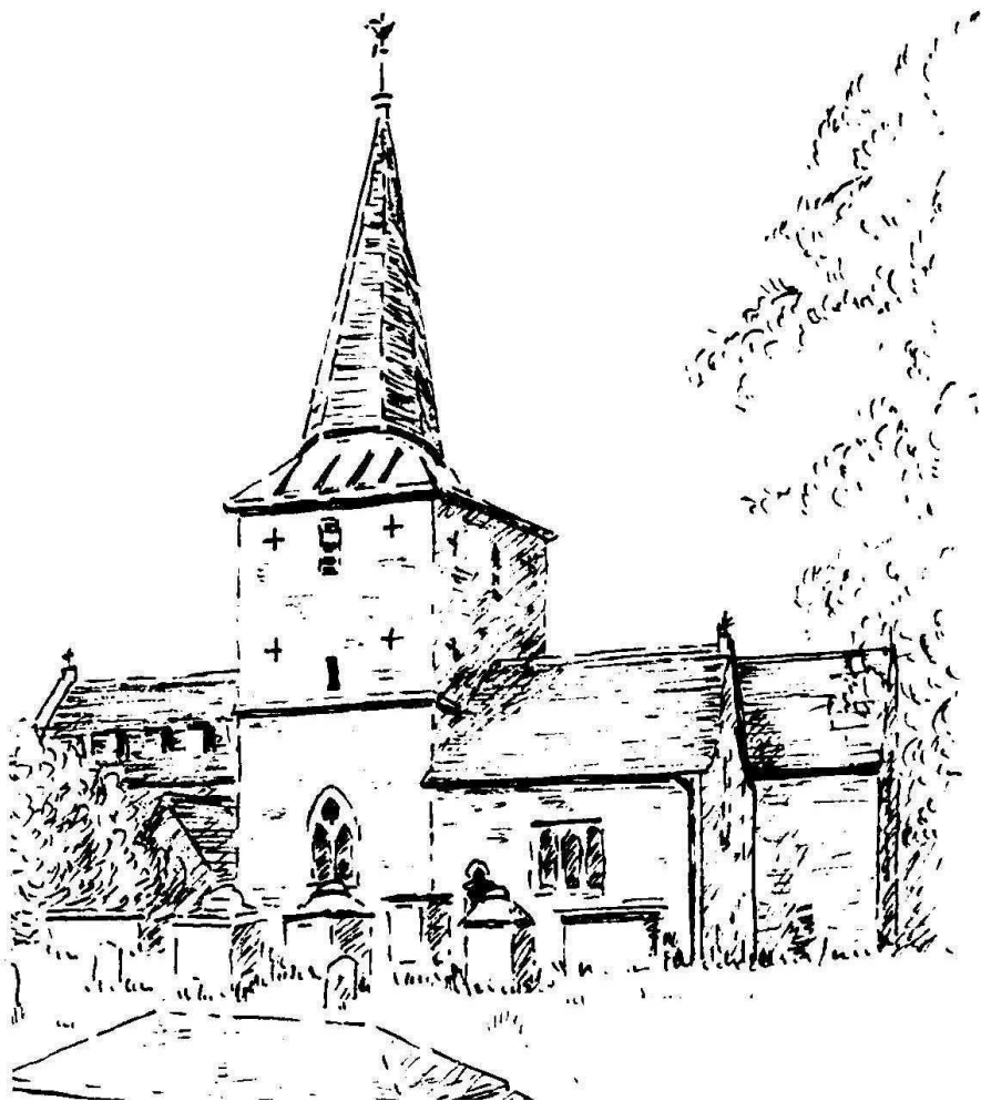
St Peter's, Rodmarton