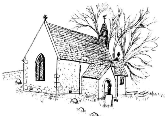
All Saints, Shorncote