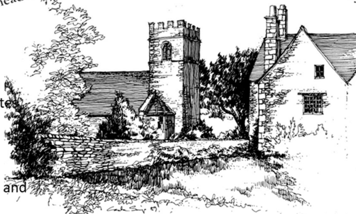
St Michael & All Angels, Poole Keynes