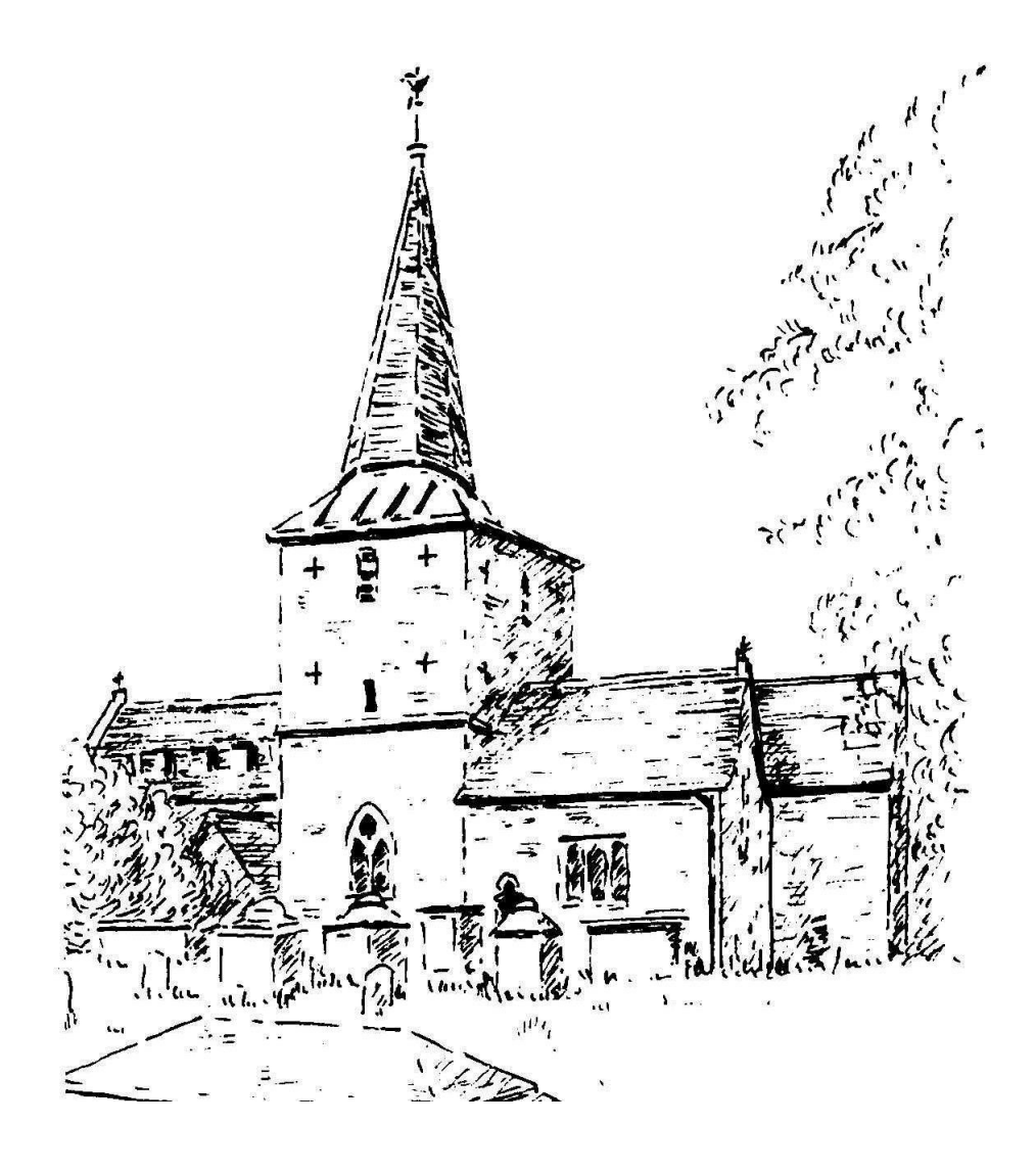
St Peter's, Rodmarton