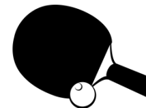
Table Tennis Tables

The Parish Council has secured 2 full size tables which are now at home in our hall and ready to be used.