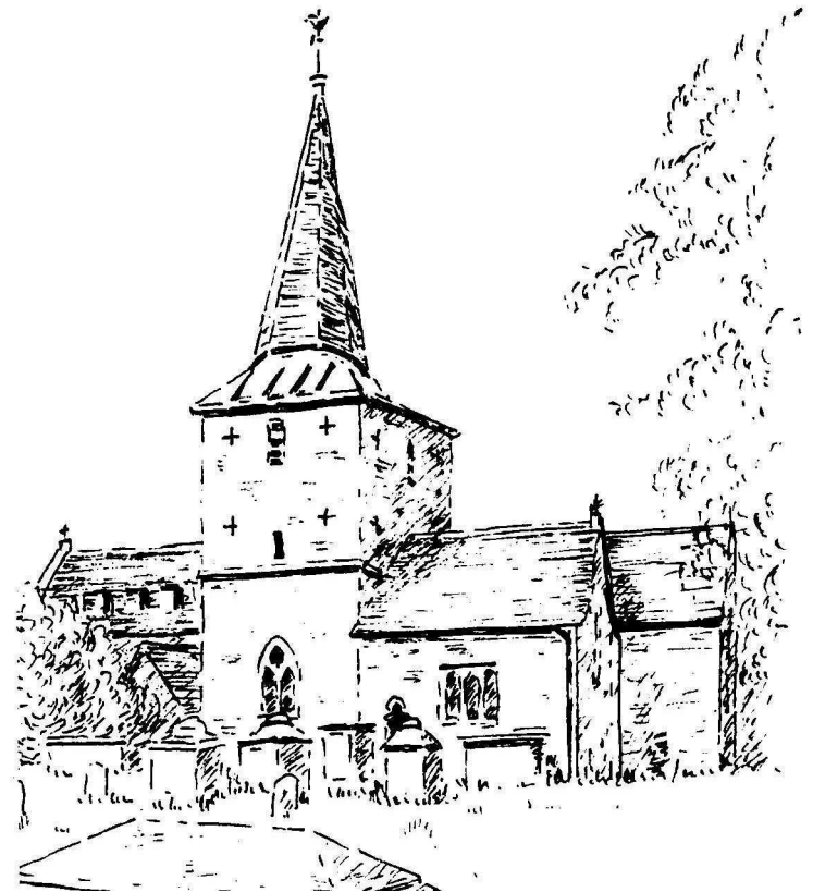
St Peter's, Rodmarton